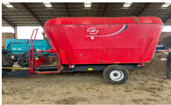
LOT 158 LOT 303