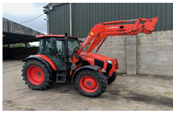
LOT 307 LOT 190